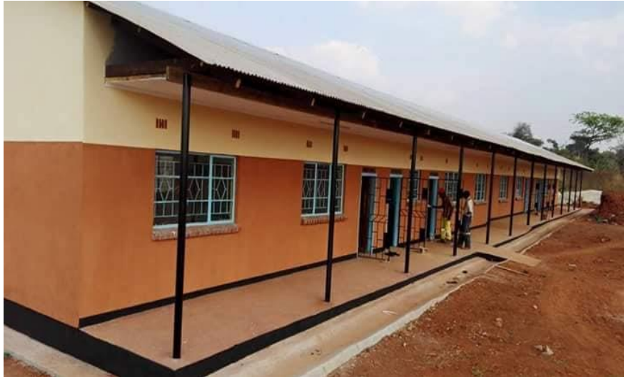
New additional 1x4 classroom block funded by the Australian Embassy in 2018

HIV/AIDS is mainstreamed into all the core programs of CCCYD. Since the inception of the organization in Solwezi in 2010, provide HIV and AIDS awareness, prevention, counselling and testing. In 2017, the organization provided counselling and testing to over 2800 people and Distributed over 64000 male condoms within markets and bus stations in Solwezi. We have two mobile Tents and 12 volunteer counsellors who provides static and mobile counselling in Western province