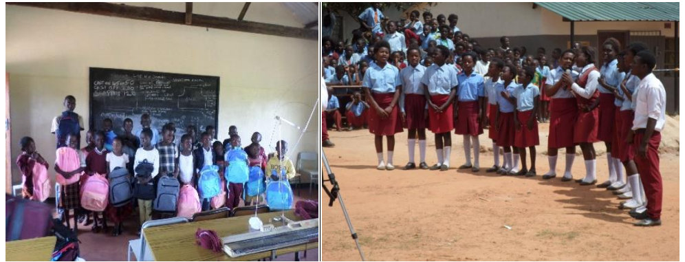
Orphans after receiving school bags

of OVCs identified by the organization. So far, the organization has provided support to over 900 orphans and vulnerable children since 2011.