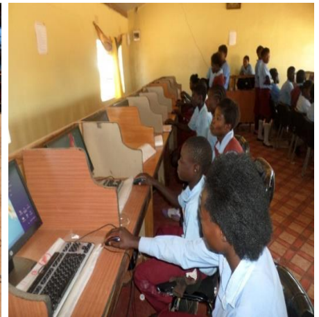
Pupils Learning Computer skills

The organization in 2017 established the community school in order to provide primary education and skills training to orphans and vulnerable children. We received the first support for the construction of 1x2 classroom block from the Edinburgh Global Partnerships (EGP) from United Kingdom. In 2018, we received the second support from the Australian Embassy to construct additional 1x4 classroom block. So far, we have enrolled a total of 348 pupils.