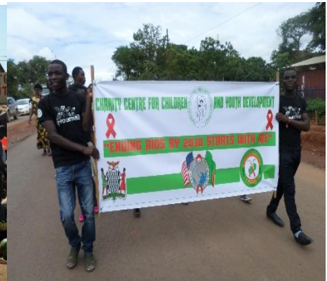
2017, World AIDS Day!

The organization in 2014 partnered with Crutches 4 Africa from United States who have so far donated over 5000 Mobility devices such as wheelchairs, walkers, Cane, Crutches etc for the support of persons with disabilities and public health institutions in North western province of Zambia