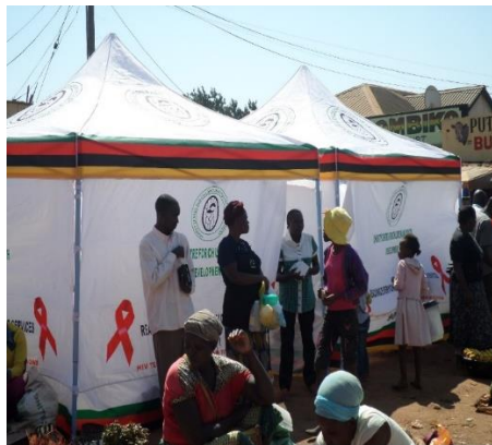
Mobile Tents for HIV Counselling and testing

HIV/AIDS is mainstreamed into all the core programs of CCCYD. Since the inception of the organization in Solwezi in 2010, provide HIV and AIDS awareness, prevention, counselling and testing. In 2017, the organization provided counselling and testing to over 2800 people and Distributed over 64000 male condoms within markets and bus stations in Solwezi. We have two mobile Tents and 12 volunteer counsellors who provides static and mobile counselling in Western province