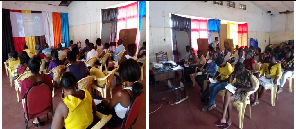
Online US based Entrepreneurship training in Mongu District Western province of zambia