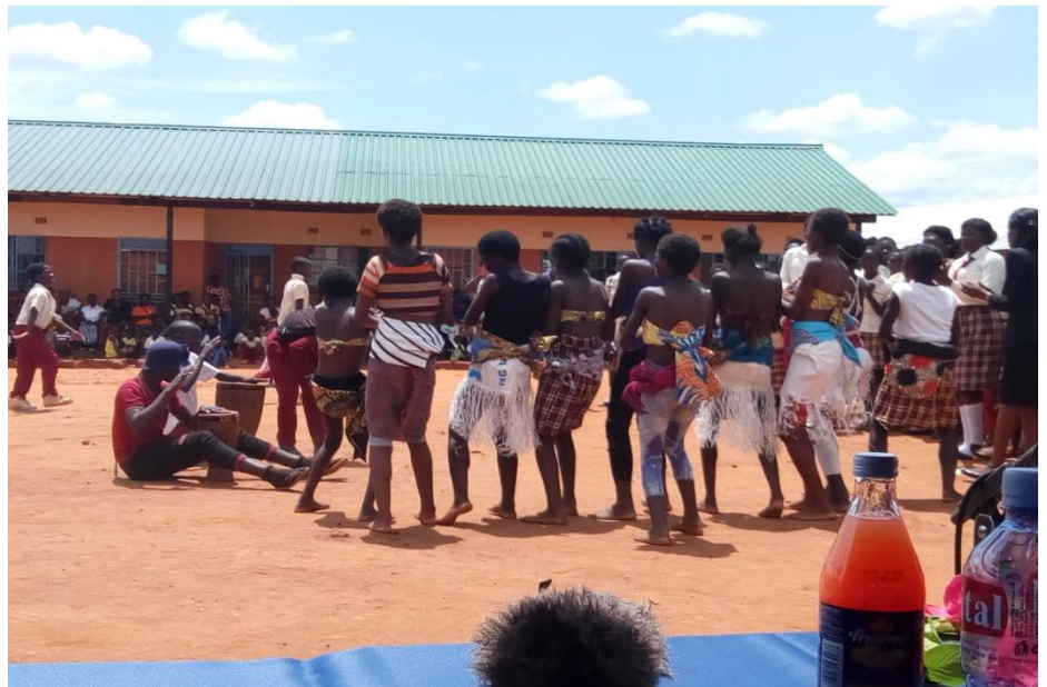
Children performing Art and Culture during the commemoration of good deeds day and official launch of the school

Fortune vocational academy/ Community School is providing primary education from grade one to seven. However, our main purpose for establishing this school is to offer vocation skills training to orphans and vulnerable children such as, tailoring, knitting, carpentry and computer skills. Through these skills, individuals can go on to support their families who currently lack access to basic needs such as adequate food and shelter. The school will also offer online entrepreneurship skills and exchange programs once power and internet is connected.