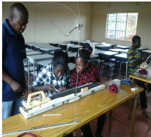
Knitting Skills student

In addition to primary education, the organization is also providing employable vocational skills. This will help orphans and vulnerable children (OVCs) to continue vocational education and find decent employment opportunities and protect themselves from risky vulnerable situations. Curriculum includes Tailoring, cutting and design, Carpentry and Joinery, Knitting, Computer Skills MS-Office, Internet; Communicative English with reading and writing skills, Photography skills