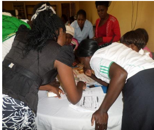
Training Women in Financial Literacy education

We provide micro-entrepreneurship through the provision of sustainable and profitable means of livelihoods, training of Income Generating Activities and financial management, support to Orphans and Vulnerable Children (OVCs') to attain vocational skills and provision of basic start up tool kits to the disadvantaged women and the youth in the community. So far, We have provided small loans as well as financial literacy trainings to over 275 women and Youth in North-western province. Savings Bank Foundation for International Cooperation has been supporting us with the provision of Micro Bus