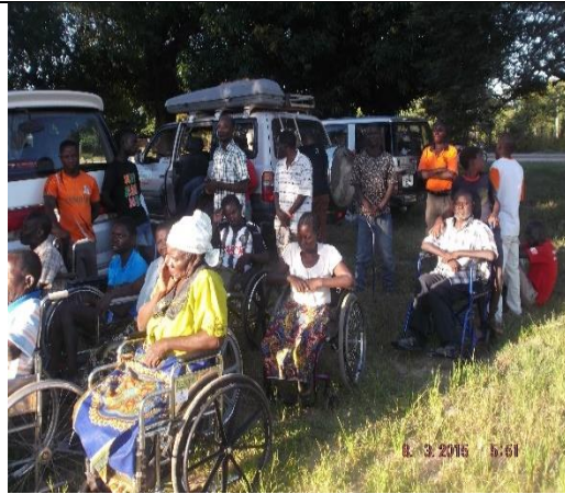
Distribution of mobility aids