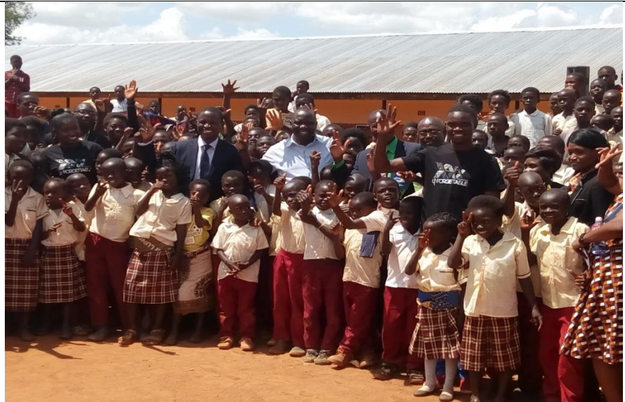
Group photo with the quest of Honor Mr Fulwe DAO for Solwezi during the commemoration of good deeds day and official launch of the school.