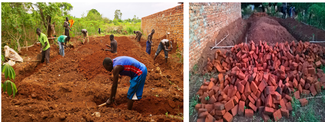
Figure 10. Excavation for College Store Foundation and bricks.

ICGM has acquired a piece of land in Gulu, donated by Mrs. Jennifer Kwitegetse to the Ministry. ICGM plans to build at least a storeroom for equipment and basic classrooms, in order to resume training and maintain continuity. Thus ICGM started excavation for storerooms in 2017 (figure 10), as part of a 5 -10 years building plan (figure 11). Sand, 1000 bricks, iron bars for reinforcement are on site. Funds permitting ICGM will start building the foundation from February 2019.