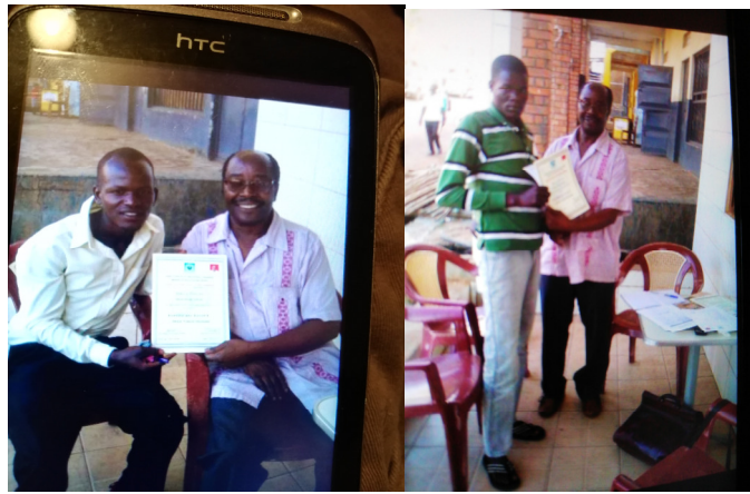
DIT Certificates issued for Motor mechanic students.

In 2017 ICGM conducted a conference in Gulu in Sunset hotel. The owner of the hotel accepted Christ as his personal savior and Lord. A woman who was a trainer of witches was delivered and destroyed all the Devil's shrines in her home. A local chief led us to his home to destroy witchcraft items which were in his compound (Figure 3). In one of the churches a woman was instantly healed of partial deafness (figure 5).