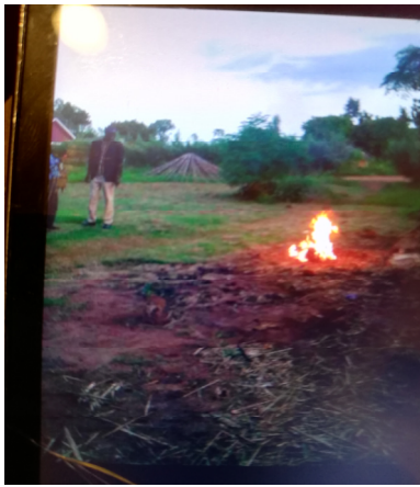
Figure 4. Burning witchcraft.