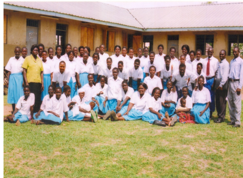
Figure 8. Pioneers of ICGM College of Design and Technology.

ICGM College of design and Technology moved back to Gulu town. Vocational training (figures 7 and 8) is temporarily on hold until ICGM acquires training premises either of her own or otherwise.