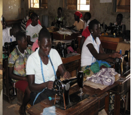
Figure 7. ICGM College training - Youth Skills' Empowerment for Job Creation and sustainable living.