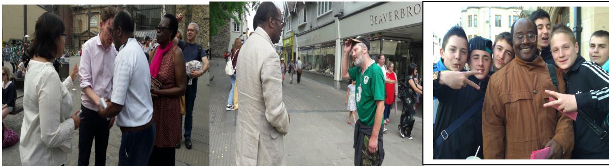
Figure 1: UK – Street Evangelism – Reaching nations, tribes and cultures on streets of Oxford.

International Christian Gospel Ministries (ICGM) conducted evangelistic campaigns in Uganda and UK during this period (Figure 1 and 2), in Kampala city, Gulu, Kisoro districts, and Oxford city. Many people were saved, healed and delivered. Lives of needy people were positively changed.