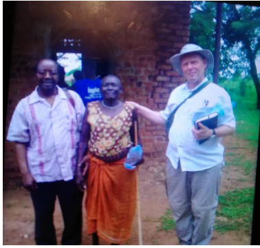
Figure 5. A woman with partial deafness Instantly healed in a service, in Gulu.