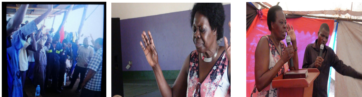
Figure 2. Overseas missions: Garage evangelism, prayer and teaching the Word of God.

In Kampala, our mission focused on conducting an empowering, encouraging pastors and churches. ICGM conducted evangelistic campaigns in local churches, a garage in Kampala, preached on radio stations (Gulu). People were saved, delivered and healed of diver sicknesses and conditions. In Kinawataka church (a suburban in Kampala); a woman who was oppressed of the devil was set free. She voluntarily brought all her witchcraft items to be burnt were burnt (figure 4). ICGM conducted a meeting in one of the largest garages in Kampala which belonged to a Muslim. Many employees were saved and healed of divers' diseases and illnesses especially chest pains (figure 2).