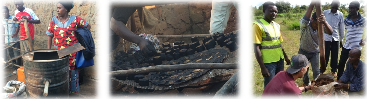
From left to right: Demonstration at Dzaleka, production of briquettes and workshop with the youth from the communities.

Another action area has been the demonstrations, workshops and trainings. We collaborate with volunteers from DAPP Dowa Teachers Training College, and we delivered different courses and demonstrations for the students. Our two main actions in the last months has been a series of workshops with youth from the community and a three days training at Dzaleka R. C.