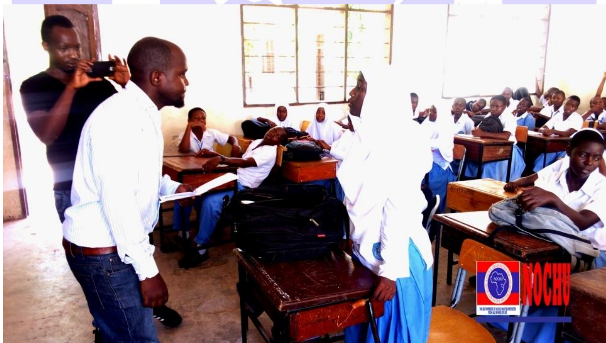
One among of the students of Bunju A secondary school contributes her opinions within HIV/AIDS club sessions.