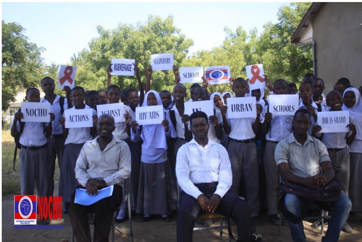
Project staffs and students of Mabwepande secondary school when opening clubs within a school