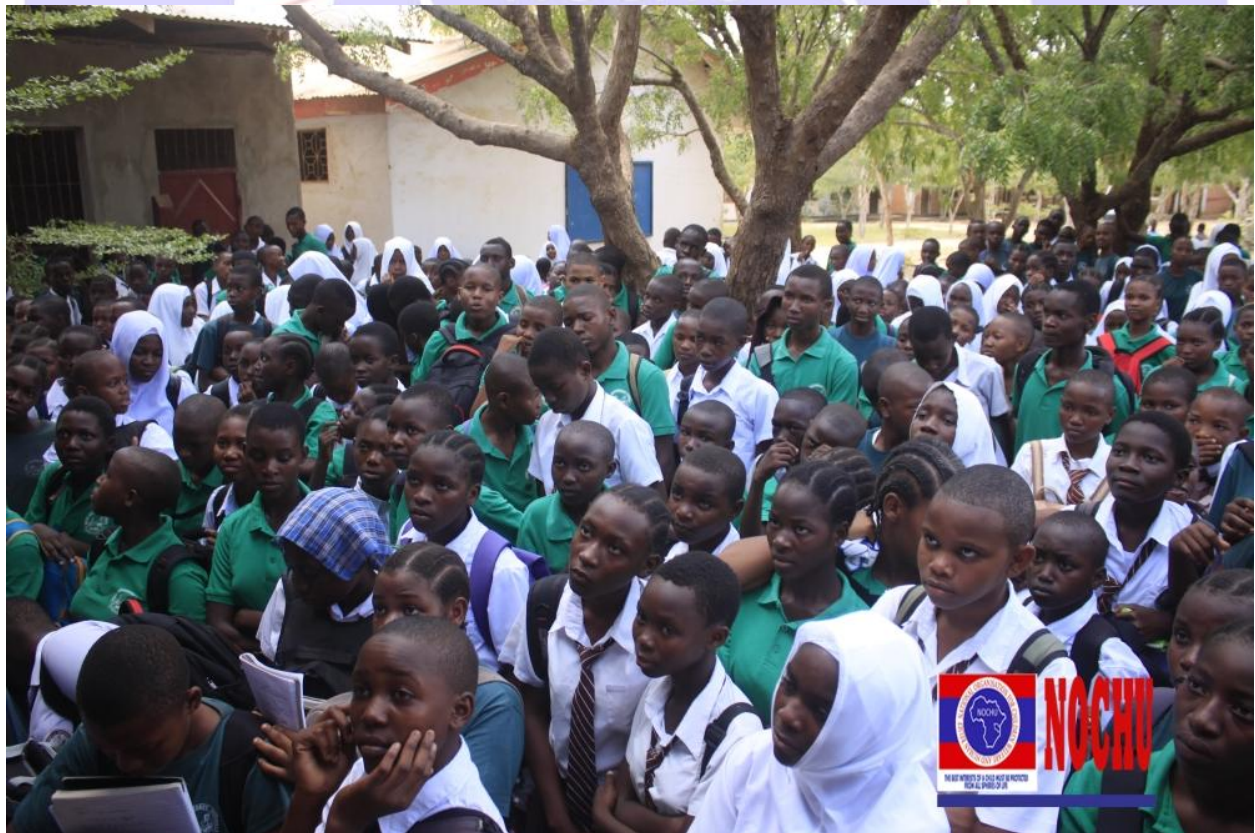
Students listening attentively on HIV/AIDS open dialogue within Boko secondary schools

This activity involved talking with students about HIV/AIDS in form of questions in which project staffs talked with students on the open space and each student responded was awarded a gift so as to motivate student's engagement in the activity regardless what he/she contributed was right or wrong. Our organization arranged questions in chronological order from simple questions to complex questions so as to assess the level of students understanding about HIV/AIDS for the purpose of preparing standard materials to be used in the coming established HIV/AIDS clubs. Also the activity was done to prepare students to accept HIV/AIDS clubs. The following are some images which were taken in the implementation of the said activity.