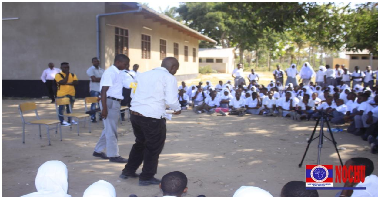
Project Staffs running HIV/AIDS open dialogue within Mabwepande Secondary school