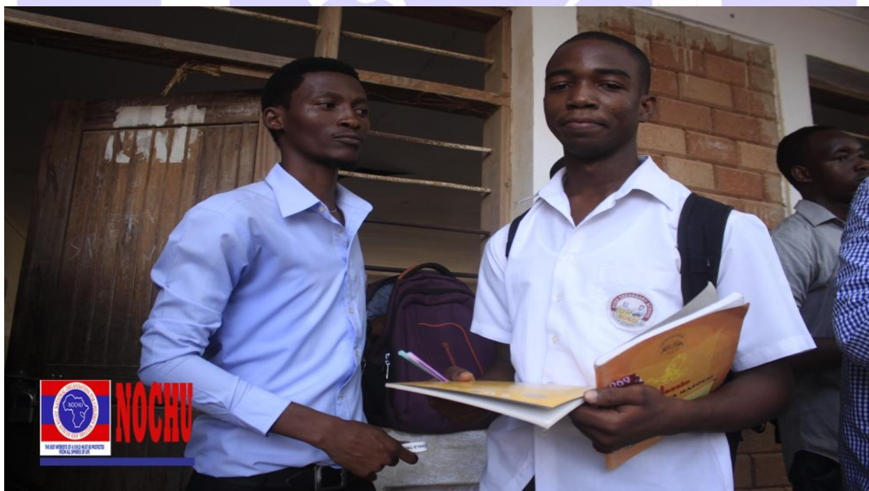
A form two student within Boko secondary school received his gift after contribution in the dialogue