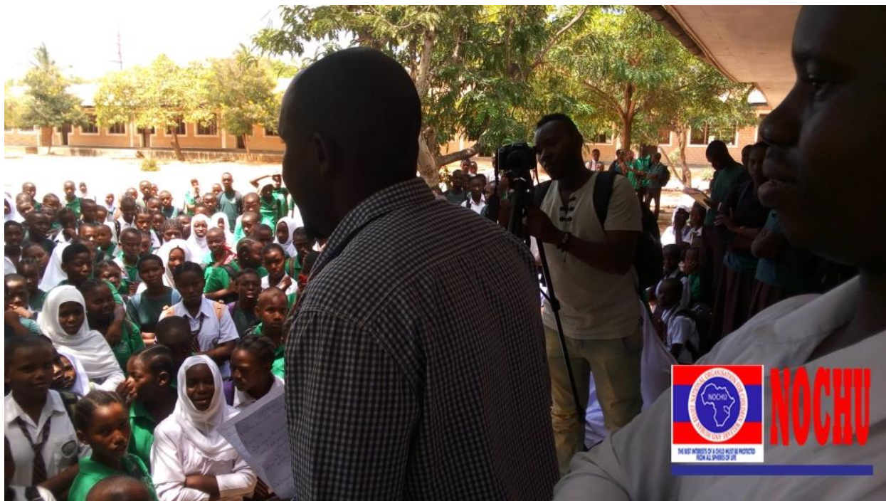
Project Staffs from the organization conducting HIV/AIDS open dialogue with students in Boko Secondary school