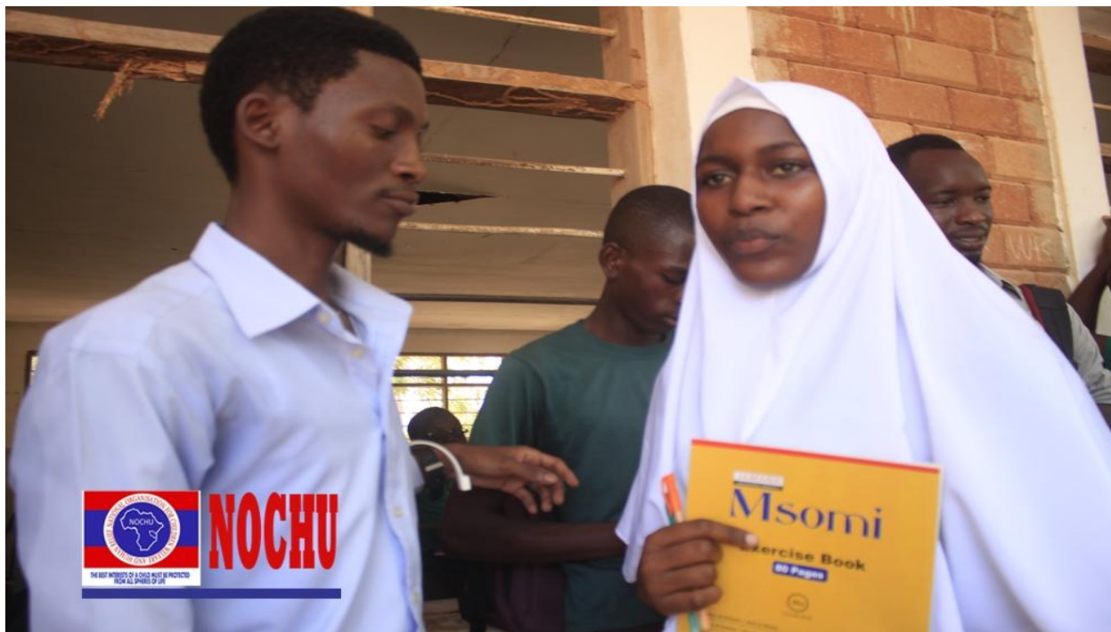
A form three student within Boko secondary school received her gift after contribution in the dialogue