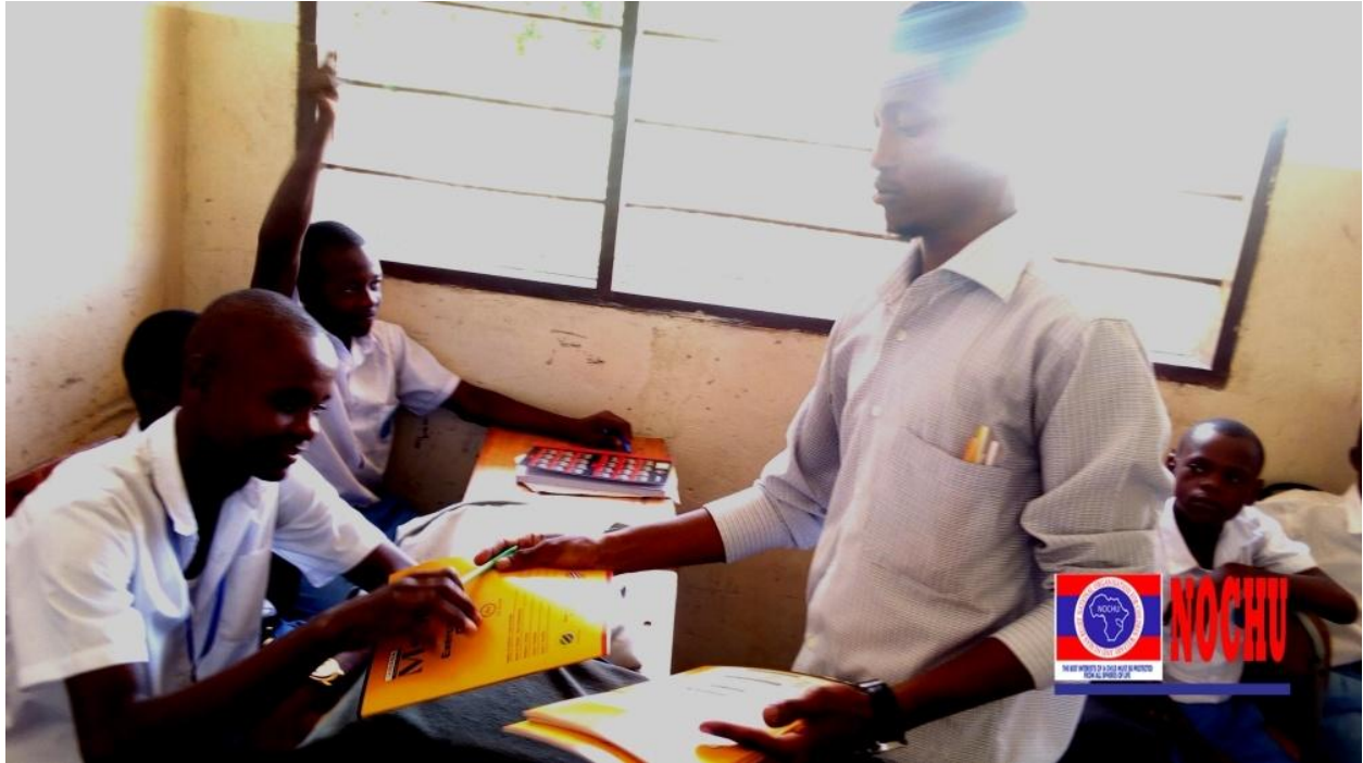
A project staff awarding student of Bunju A secondary school after he provided an accurate answer in the HIV/AIDS club session