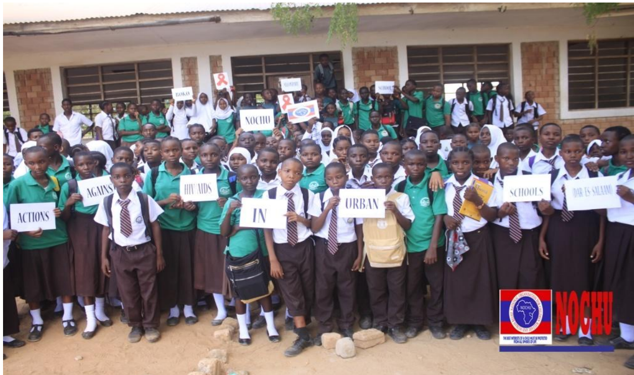
Students of Boko secondary school when Opening HIV/AIDS club within the school