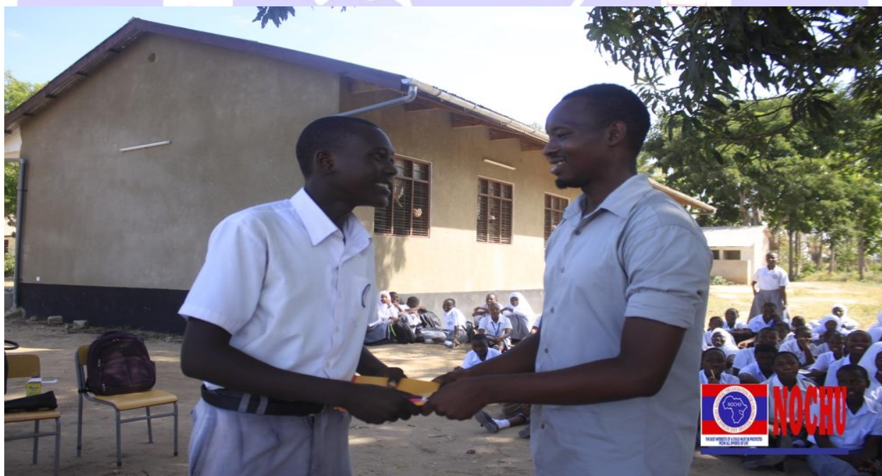
One among of the students of Mabwepande secondary school receiving a gift for contributing his views on HIV/AIDS open dialogue within the school.