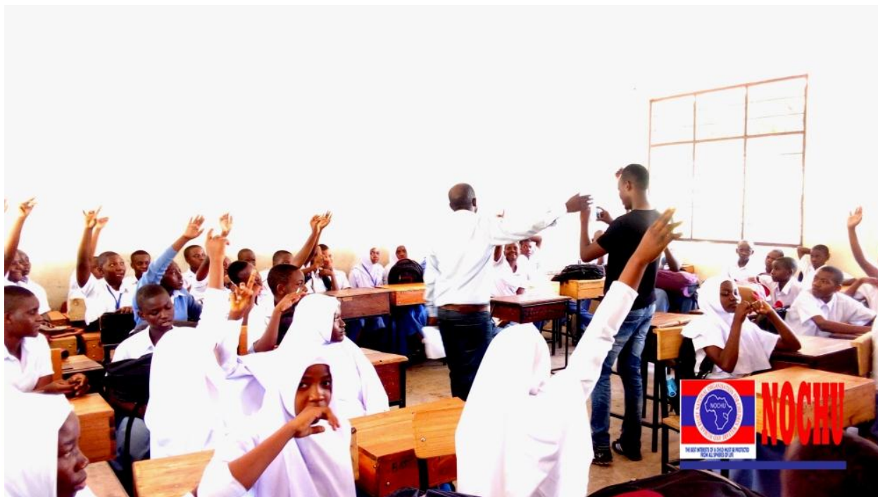
Students are responding to the questions asked by one of the project staff in the one of among HIV/AIDS club sessions within Bunju A secondary school