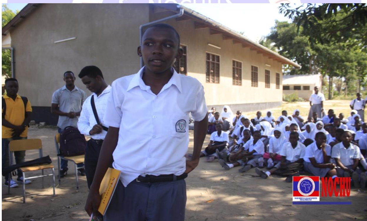
A student going to sit after contributed his views and receiving his gift about in HIV/AIDS open dialogue within Mabwepande Secondary school